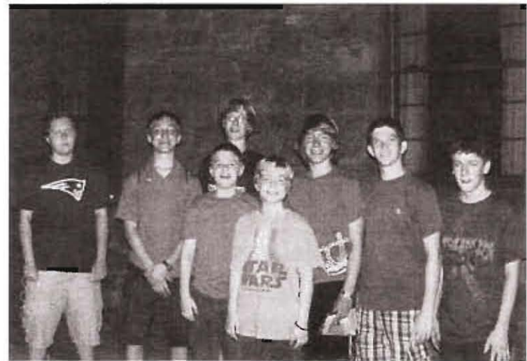
Sight & Sound Theater Trip 2012